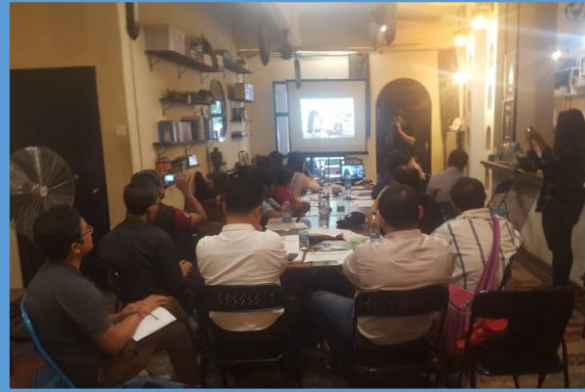
Photos: Feeding back next steps and ideas from Indonesia (left) and Malaysia (right) hubs.