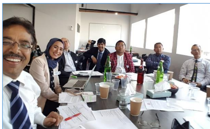
Photos: Indonesia hub (top left), Bangkok hub (top right) and Australia hub (left) workshops underway.